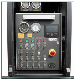
Air Excavation Controls